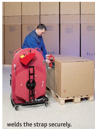
welds the strap securely.

Without bending, neat, reliable and quick: The pallet is strapped in 1 minute.