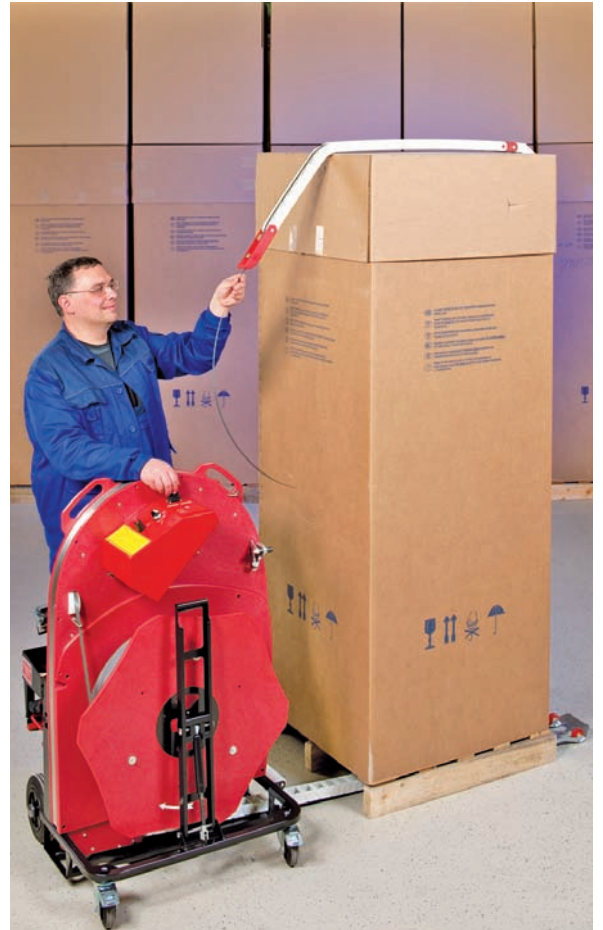
Even high packaging is no problem for ErgoPack systems: with a further attachment, pallets up to 3.0 m in height can be strapped reliably and quickly.

The manual strapping of pallets is amongst the activities in which workers have to bend most frequently: a worker has to bend over twice per strap and walk round the pallet once. For proper strapping using two straps, this means bending over four times and walking round the pallet twice. For 50 pallets per day, this means bending over 200 times and walking around the pallet 100 times. In one week, this totals bending over 1,000 times ... ErgoPack puts a stop to all this!