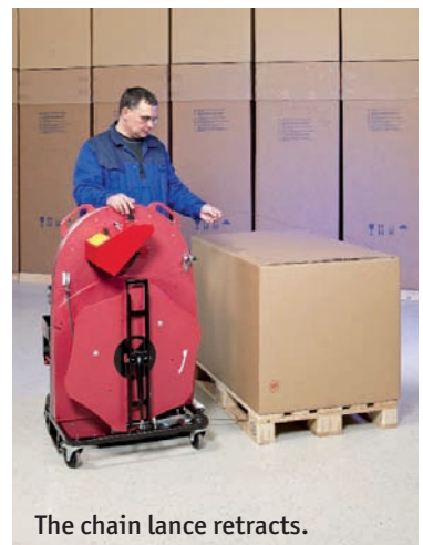
The chain lance retracts.