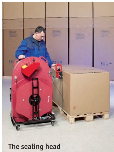
The sealing head