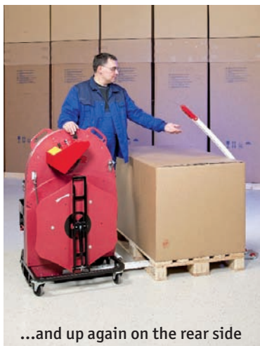
...and up again on the rear side