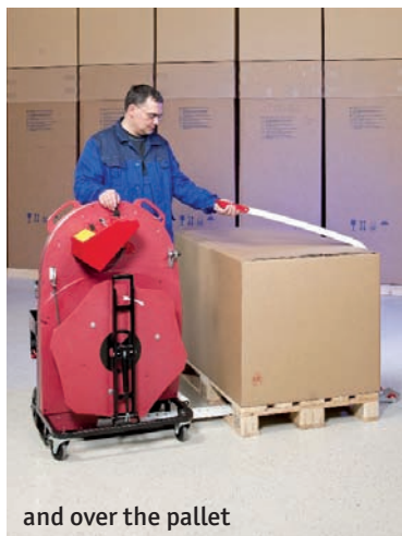
and over the pallet