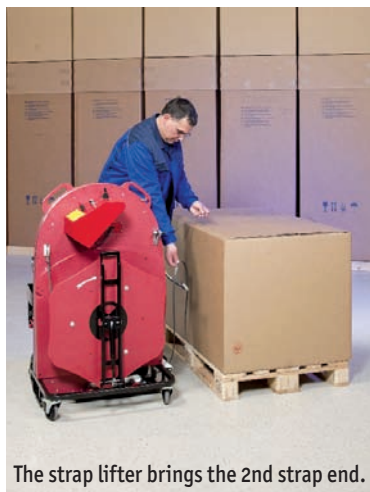
The strap lifter brings the 2nd strap end.

ErgoPack provides training for customers' employees on delivery of the systems