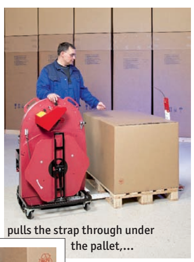
pulls the strap through under the pallet,...