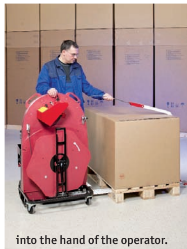
into the hand of the operator.